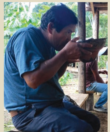
Top: The leaders come from villages sometimes deep in Ecuador's jungle, accessible only on foot. Above right: Chicha is a common beverage in Ecuadorian villages.

So we considered several questions: What is the biblical truth about this topic? How do we avoid such a temptation, and how should we handle believers who have fallen into the sin of drunkenness?