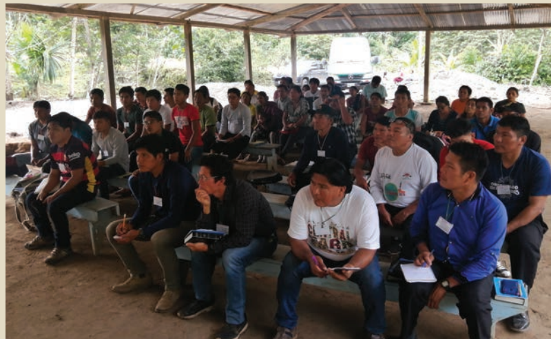
From top (L–R): In late 2025, 11 men participated in the Daniel Project, three of whom are pictured here; For some, the trip out of the jungle involves canoe travel; A bus takes the men to their destination; Believers learn during an intensive teaching session; A village assembly gathers for teaching.